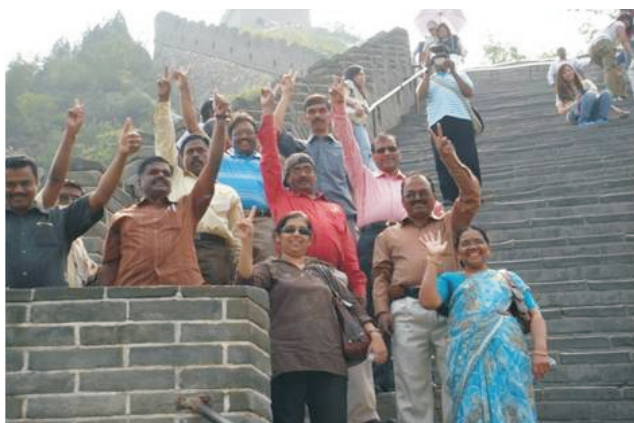
The highlight of each batch of APGDUM is a foreign visit, which took them to China in 2009.